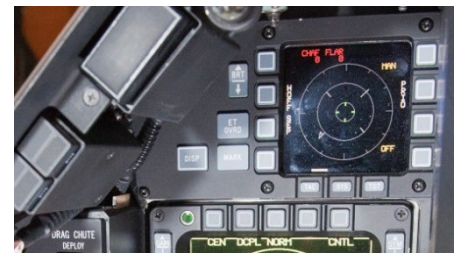
ATD in F-16